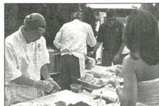
Guests dined on Prime's signature cuisine, including sushi.